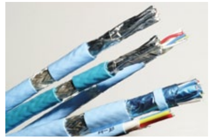
Prysmian cables for aerospace

Thanks to its long-lasting expertise and reactivity recognised by the aerospace key accounts, Prysmian BU Aerospace is involved in most strategic client’s processes. Major recent achievements are the Comac qualification to supply the ARJ21 and C919, Ariane 6, sole selection by Latecoere, a major OEM for optical fibres.