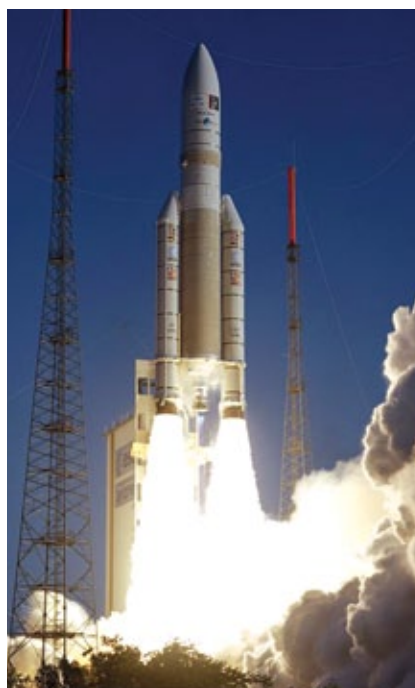
Prysmian, partner of Ariane programme