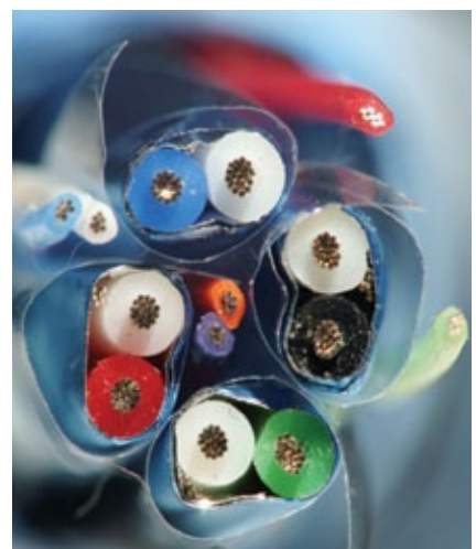
“Prysmian innovates constantly, along with its partners”