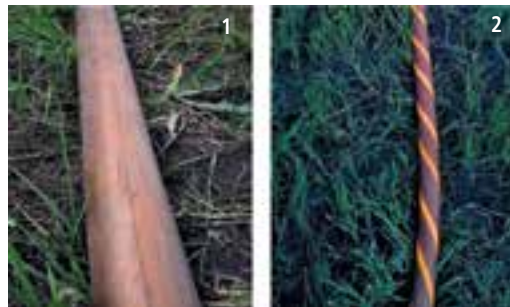
Pic:1 TENAX-LUMEN after one year of use (left). The surface shows the usual abrasion. Pic: 2 The same cable in the illuminated state in the dark: TENAX-LUMEN is clearly visible even with a dull sheath.