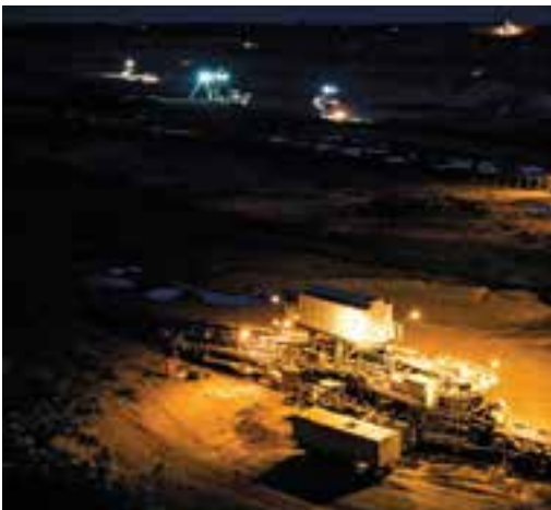
Open-pit mine at night: The medium-voltage cables are difficult to locate in insufficient lighting.

In addition, there is a risk that during operation, mobile equipment will repeatedly block the light waves and prevent them from reaching the tape.